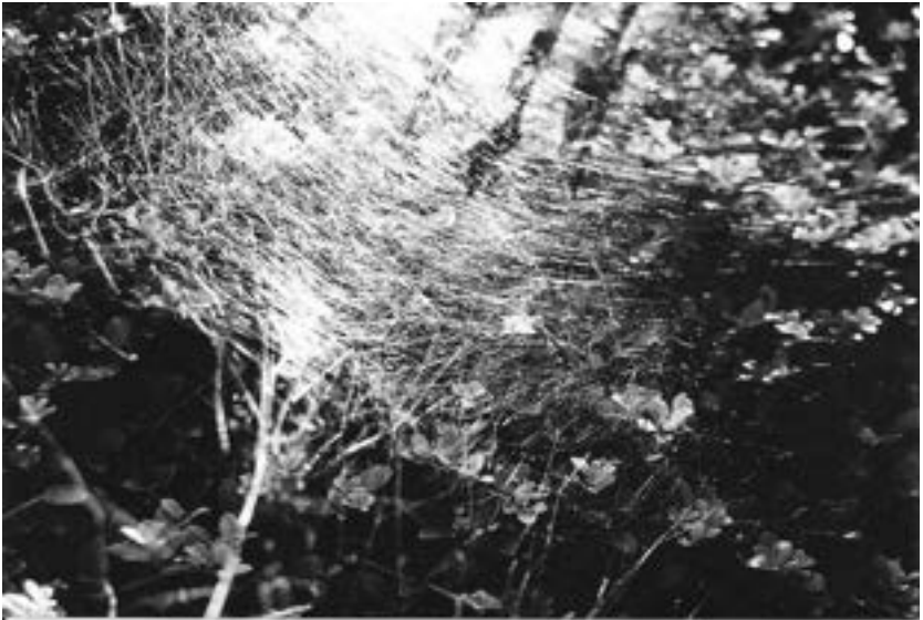
Photograph by Abbigail Selig