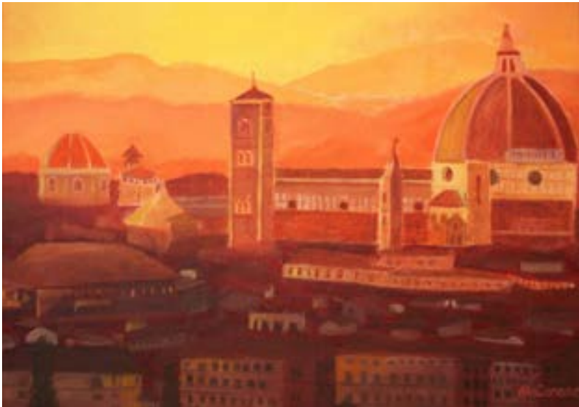
Duomo at Florence