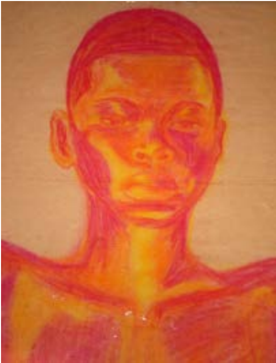
Conté Portrait by Rebecca Munro (Africa, 1964)